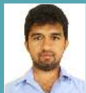
Prasthant ME 2015 Class

For me it's one of the best colleges, I improved my skills a lot here it's good for sports as well as academics. At Farah you'll see education as an entertainment, so education is always fun here. The people, the faculty, the experience and the days over Farah were not just memorable but also knowledgeable.